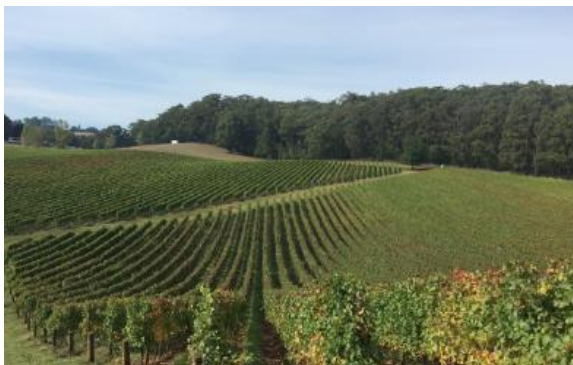
Wombat Creek Vineyard Yarra Valley