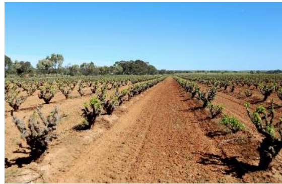
Watunga Road Vineyard Barossa Valley