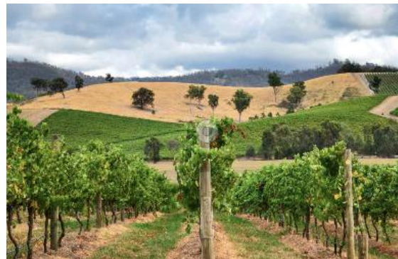
Highbow Hill Vineyard Yarra Valley