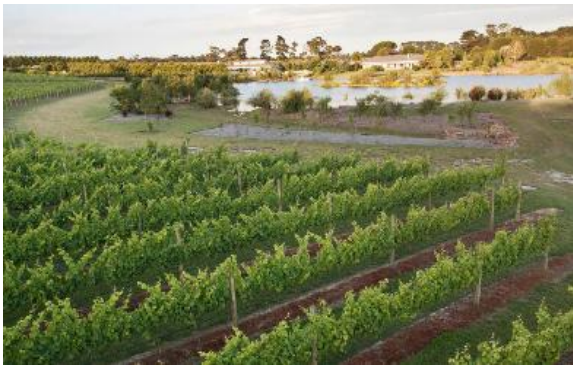
Capella Vineyard Mornington Peninsula

We are located in some of the best wine regions around Australia and maintains long term partnerships with local and trusted vigneron.