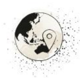
A World of Wine Under One Label