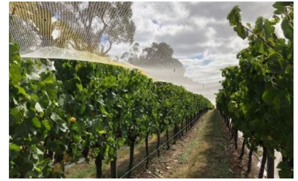
Native Point Vineyard Tasmania