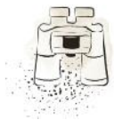
Doing Things Differently